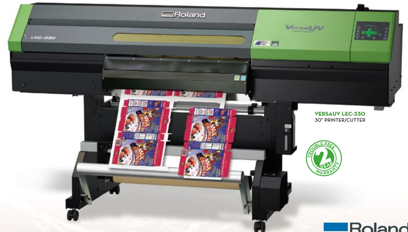
VERSAUV LEC-330 30" PRINTER/CUTTER