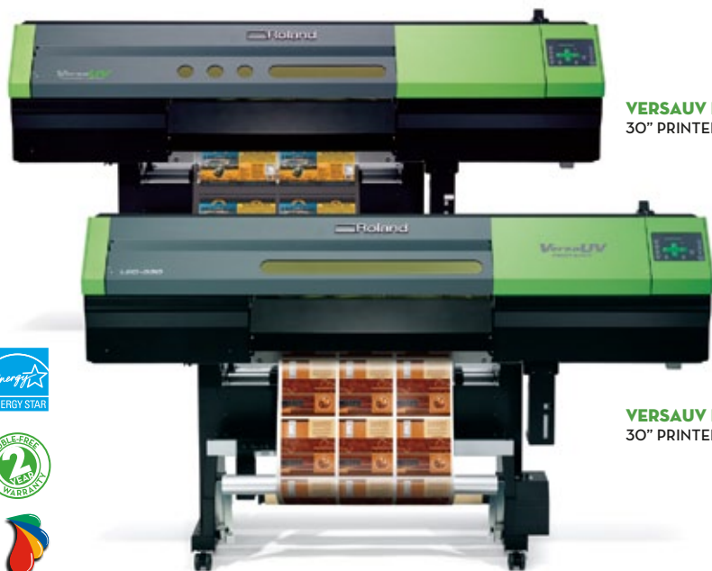
VERSAUV LEC-330 30" PRINTER/CUTTER