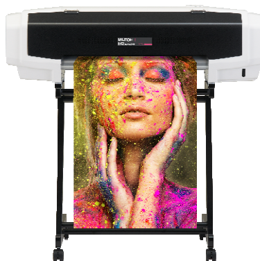
Mutoh VJ 628X