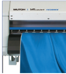
Modern, new, design.