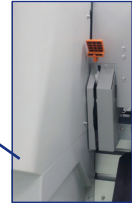
Rear media feed lever.